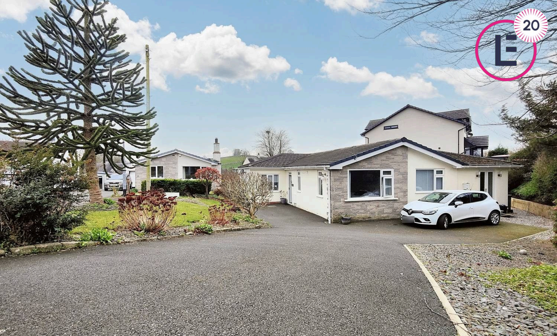
1 Sycamore Grove, Ackenthwaite Milnthorpe